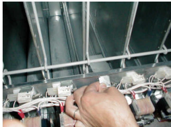
Figure 6 1 - 432,070,17x.x3 Narrow Column Sold-Out Paddle