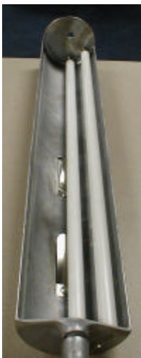
609,070,30x.x3 Rod & Spring Assembly 801,903,24x.x1 White Tube