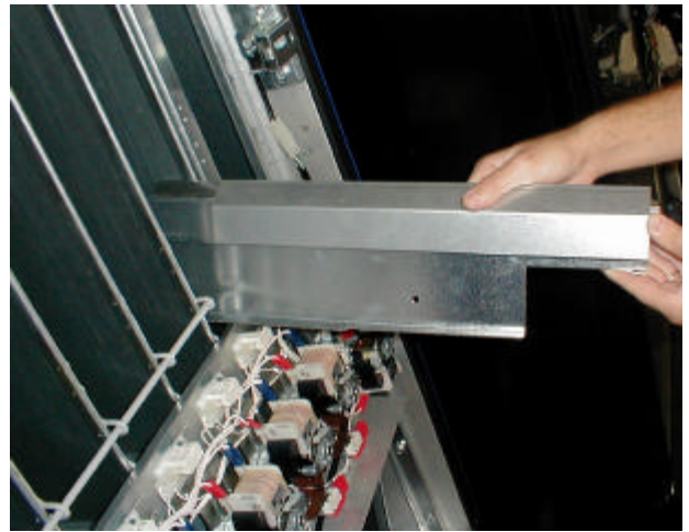
Figure 2 Can Shim Installation